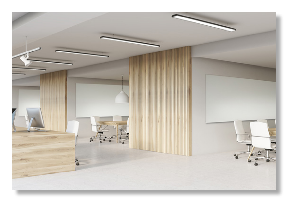
Frameless Glass Marker Boards